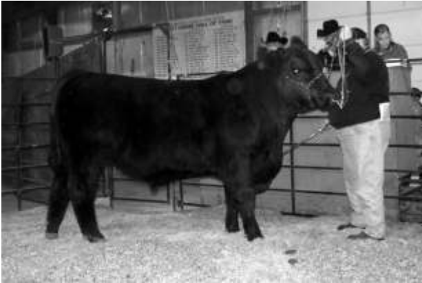
Top Bull: MBA Northern Enforcer 2 S24 Consigned by Mitteness Bros Angus, Ada, MN. Lot 42, a 3/23/07 son of Northern Improvement 4480 GF