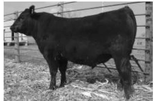
Herd based on low birth weight and high growth.

Gregg Cell: 507-227-5331 Neil Cell: 507-215-1114