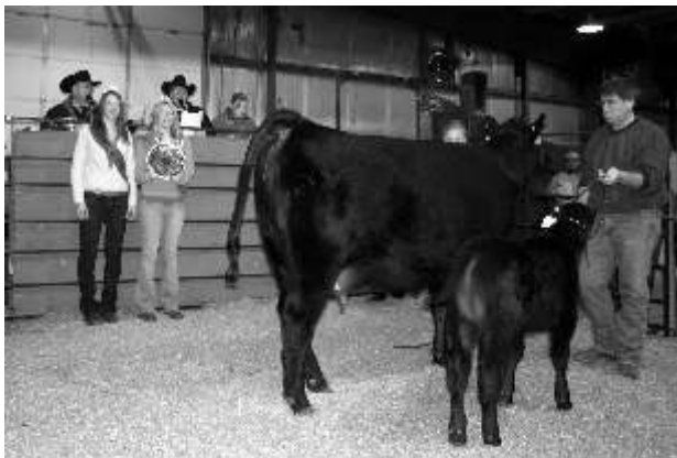
Top Cow: CVR Moriah 6217 consigned by Cannon Valley Ranch, Goodhue Lot 25 a 2/10/06 daughter of Connealy Lead on. with a bull calf by HSAF Bando

Top Bull: Lot 46–Nords Conclusive 770, 4-2-07 bull by Buffalos Conclusive BN46. From Luke Nord Wolverton MN. To Gary Stai, New London, MN, for $4,200, two-thirds interest.