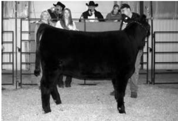
Top open Heifer: Lot 9 SHF Heiress 707 , a 1/17/07 daughter of Freedom 104 was consigned by Shady Hill Farms, Dusty Martin of Blue Earth, MN.